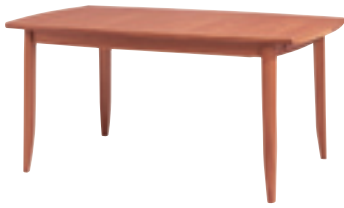
▲ 2804 Extending Dining Table

Matching crown veneers with banding. Supplied with 2 extension leaves stored within the table.