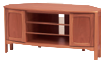
5874 Shaped Corner TV Unit Removable and adjustable central glass shelves with wooden front trim. Each outer cupboard has 1 adjustable wooden shelf.

H 52cm W 110cm D 50cm (depth along wall 78cm)