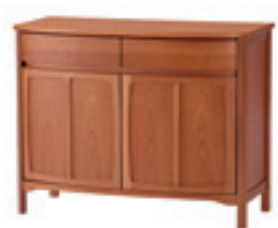
1904 Shaped 2 Door Sideboard Removable shelf, soft close drawer system, flexible cutlery tray in left hand drawer.