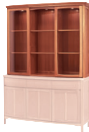
4804 Shaped Glass Door Display Top Unit Low voltage downlights, removable and adjustable glass shelves with wooden front trim.

H 196cm (combined with model 1814) W 139cm D 49cm (combined) D 36cm (top section)