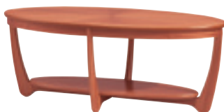
5844 Sunburst Top Oval Coffee Table Banded sunburst top.