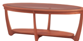
5834 Glass Top Oval Coffee Table Bevelled glass. Sunburst veneered shelf.