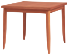
▲ 2814 Flip Top Square Dining Table

Reciprocal action sliding top allows for easy extension. Comfortably seats up to 10 people when fully extended.