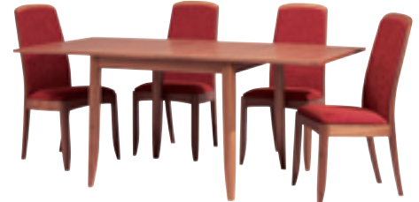
▲ Extended (2814 open)

Easy action flip top extension doubles table size.