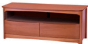
5834 Shaped TV Unit with Drawers Soft close drawer system, drawer depth to take CD/DVD. Back panel wire management cut-out.