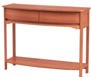
5854 Shaped Console Table Soft close drawer system.

H 196cm (combined with model 1814) W 139cm D 49cm (combined) D 36cm (top section)