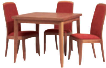
▲ Flexible Dining (2814 closed)

H 76cm W 90cm - closed D 90cm W 180cm - extended