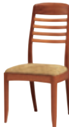
▲ 3814 Ladder Back Dining Chair