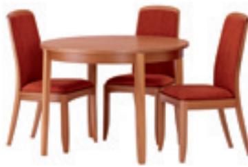
▲ Flexible Dining (2904 unextended)

H 76cm W 104cm - closed D 104cm W 142cm - extended