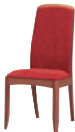
▲ 3804 Fully Upholstered Dining Chair

Easy-action folding centre leaf. Comfortably seats up to 6 people.