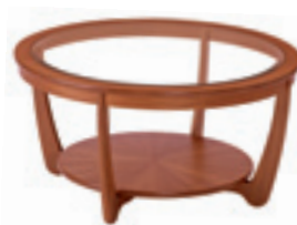
5914 Glass Top Round Coffee Table Bevelled glass. Sunburst veneered shelf.