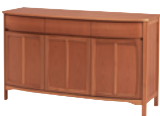
1814 Shaped 3 Door Sideboard Removable shelves, soft close drawer system, flexible cutlery tray in middle drawer.