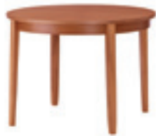
▲ 2904 Sunburst Round Dining Table

Easy action flip top extension doubles table size.