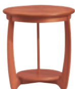
5824 Sunburst Top Round Lamp Table Banded sunburst top.

H 52cm W 110cm D 50cm (depth along wall 78cm)