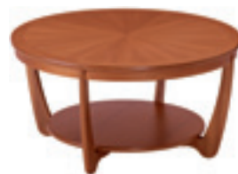
5924 Sunburst Round Coffee Table Banded sunburst top.