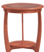
5814 Glass Top Round Lamp Table Bevelled glass. Sunburst veneered shelf.