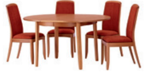
▲ Extended (2904 extended)

Easy-action folding centre leaf. Comfortably seats up to 6 people.