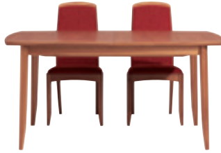
▲ Flexible Dining (2804 unextended)

H 76cm W 160cm - closed D 95cm W 203cm - 1 extension W 246cm - 2 extensions