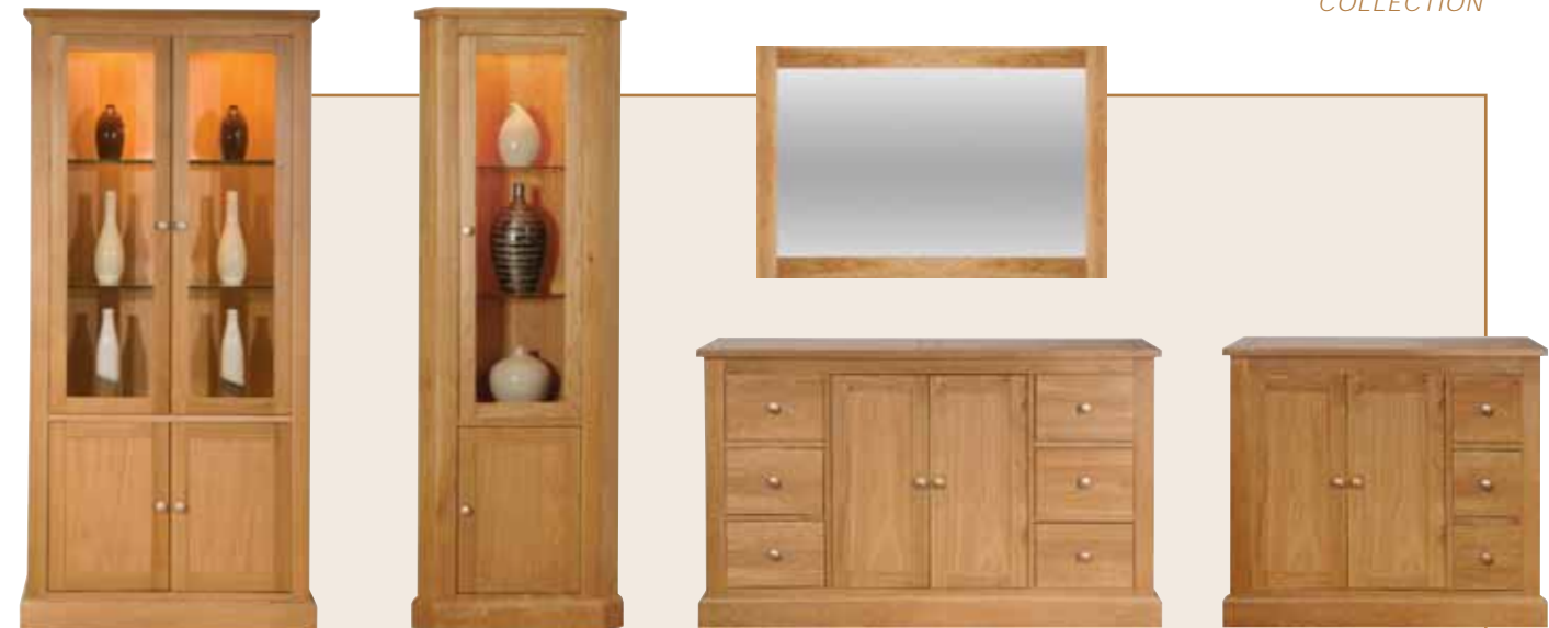
2 Door Display HAR 025 Width: 900 Height: 1900 Depth: 360