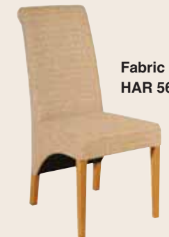
Fabric Chair HAR 560