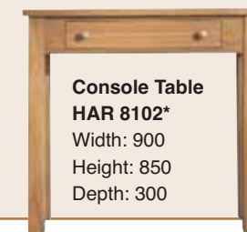
Console Table HAR 8102* Width: 900 Height: 850 Depth: 300