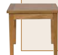
Lamp Table HAR 8101* Width: 500 Height: 500 Depth: 500