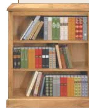
Small Bookcase HAR 112 Width: 965 Height: 1092 Depth: 305