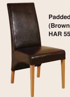
Padded Chair (Brown) HAR 550N