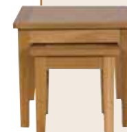
Nest HAR 8106* Width: 500 Height: 500 Depth: 500