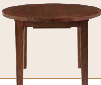
Circular Extending Dining Table* REG 440 Width: 1100-1500 Height: 700 Depth: 1100