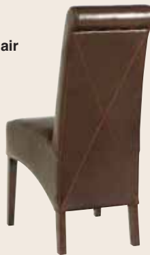
Roll Back Chair REG 560 Copper