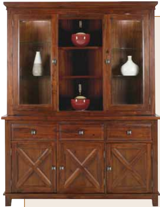
Large Display REG 020 Width: 1501 Height: 1950 Depth: 450