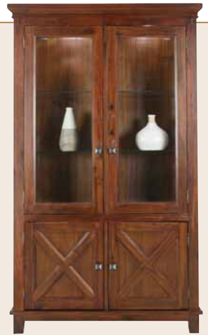
Two Door Display REG 025 Width: 1032 Height: 1700 Depth: 390