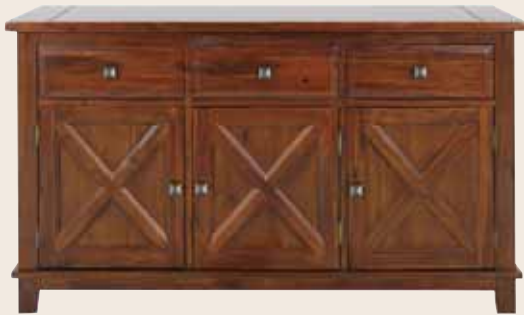
Large Sideboard REG 040 Width: 1501 Height: 850 Depth: 450