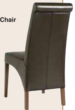
Roll Back Chair REG 520 Brown