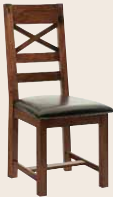
Cross-stick Chair REG 500