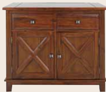
Small Sideboard REG 016 Width: 1054 Height: 850 Depth: 450