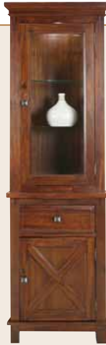
Corner Display REG 127 Width: 688 Height: 1950 Depth: 402