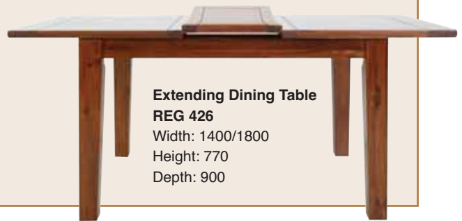
Extending Dining Table REG 426 Width: 1400/1800 Height: 770 Depth: 900

Furnishings (Fire) (Safety) Regulations 1988, amended 1989 and 1993. All foams are combustion modified. While every care is taken when compiling this brochure to ensure the colours shown are as true as printing methods allow, they should be taken as a guide only and accuracy cannot be guaranteed. We reserve the right to alter specifications without prior notice. Owing to the supply of natural materials we cannot always guarantee a perfect match. Errors and omissions excluded.