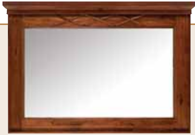
Wall Mirror REG 037 Width: 1170 Height: 800 Depth: 60